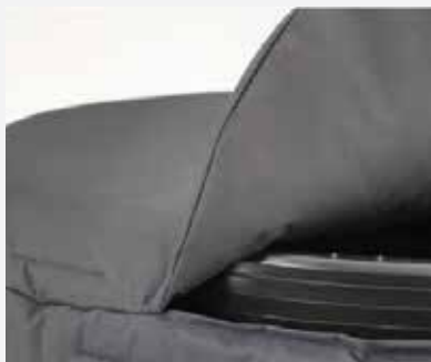
Flap for filler access.