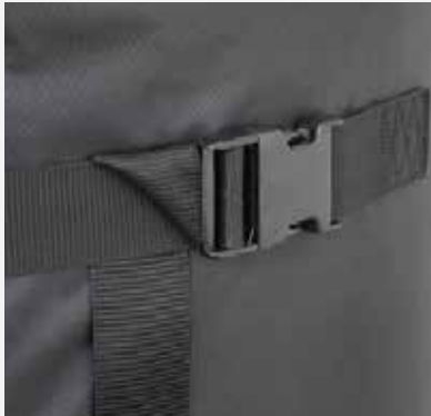
Quick release buckles are used for fixing the jacket quickly and easily.