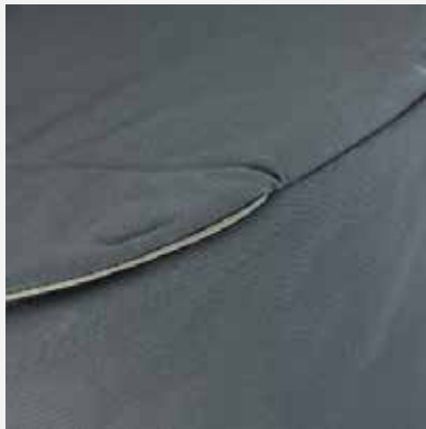
Lightweight and can be used in conjunction with the HBD.