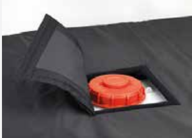
Flap for filler access.