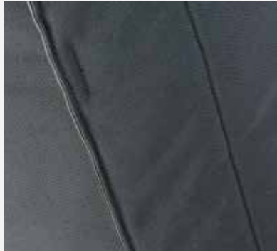
Easy installation with Velcro fixing strips.