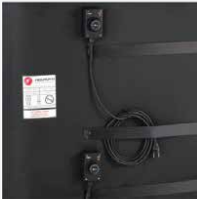
Bespoke printing for the HIBC/B is available, detailing your company information and specifications for the element.