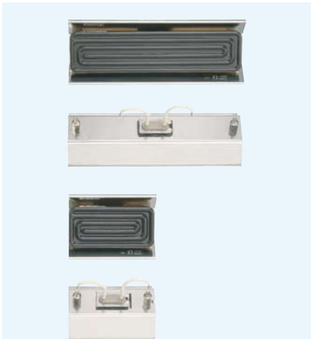
Fig. 71: Elstein construction set REF/250 with SHTS/1 (Top) Elstein construction set REF/125 with SHTS/2 (Down)

By quoting the REF/250 or REF/125 construction set designations and the radiator type required, the REO/250 and REO/125 reflectors are available fitted with the FSR, FSM, HFS, HSR, HTS and SHTS series ceramic infrared panel radiators.